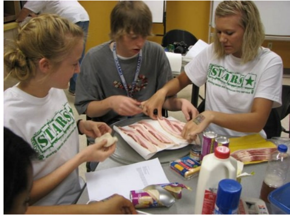
Photo Caption: Members of the Hoover High School STARS participate in GYSD 2010 at the Animal Rescue League.

Free printed materials , including posters and strategy guides, may be ordered by organizations in the continental United States that will be participating in GYSD.